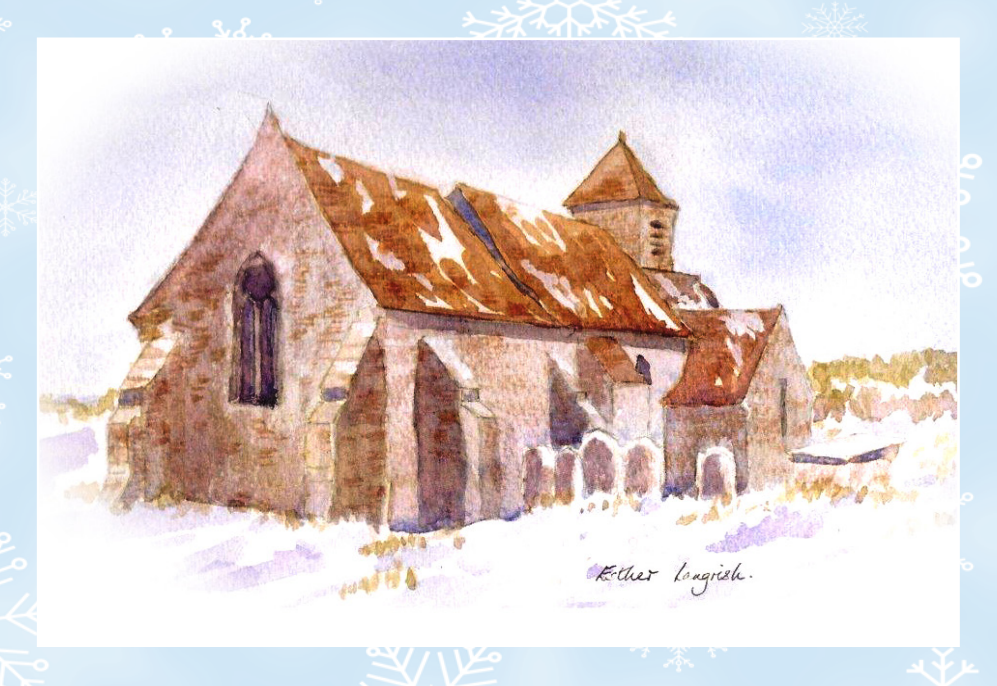
A collection of carols for the Climate Crisis written by villagers from Binsted in West Sussex, where campaigners are fighting to stop the planned A27 Arundel Bypass.